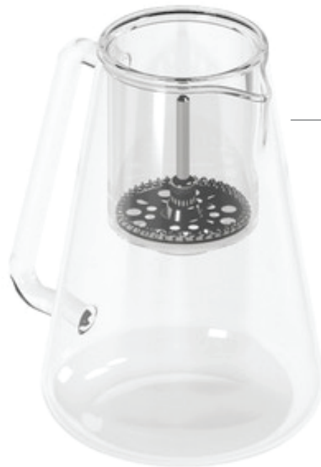
GLASS PITCHER made of resistant borosilicate glass ideal to serve your coffee or tea